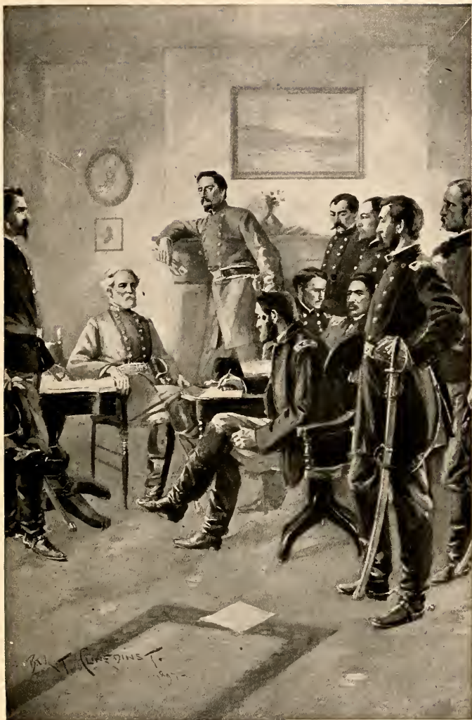
THE SURRENDER: GENERAL GRANT AND GENERAL LEE AT APPOMATTOX